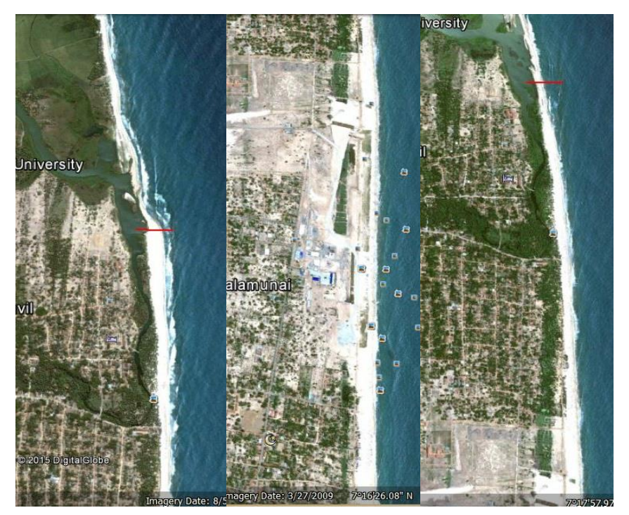
Harbour Area Oluvil-Palamuani