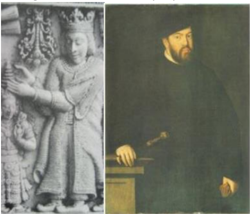
Fig 13Fig 14 King Joao 111 of Portugal Ivory Casket inv.no1241, rear view bottom right