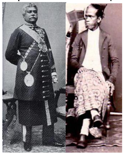
Fig. 21Fig. 22 Higher administrative officers during the period of British rule in Sri Lanka Early 20th Century

It is also identified that the elite or the high rankers of the administrative society during the early twentieth century in the south of Sri Lanka wore long coats with a long cloth up to the ankle and wore long trousers beneath the cloth. What is noticeable here is that instead of Prince Dharmapala's long coat and long lower piece of cloth a new dress form, trousers worn beneath the cloth emerged. This new fashion brought an interesting dress composition and elaborated the perception of the perceivers of that society. The mode of the new dress composition signified 'smart gentleman'. It seems that with the passage of time the elite male has ignored the lower cloth and practiced wearing a long coat and trousers. In this way it seems that people in the society could continuously convey dress signifiers according to their wish. However it is apparent that the culture of the society had ignored some dress forms and re-formed and adopted another dress for elite males in the middle phase of the twentieth century in Sri Lanka.