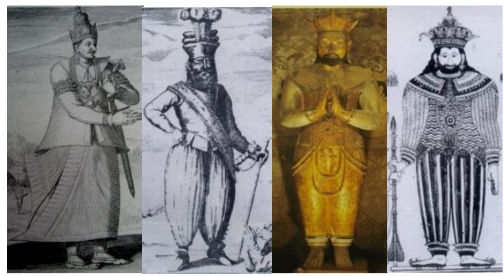
Fig 8 Fig 9 Fig 10 Fig 11

King WimaladharmasuriyaI King Rajasimha II KingKirthi Sri Rajsimha King Sri Wickrama Rajasimha