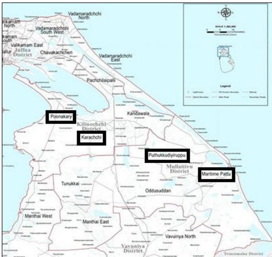
Figure 1: Location of the four DS divisions in the Northern districts in Sri Lanka (Locations are highlighted in the black box)