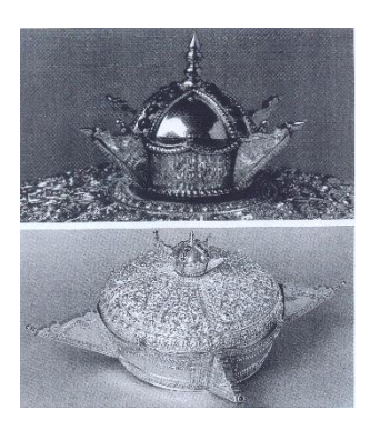
Figure 2 The Silver Crown of King Senerath(Goonaratne, B. 1995. The Epic Struggle of the Kingdom of Kandy. London : Argus Publications . p.227)