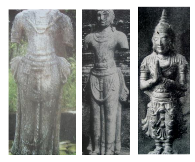
Fig 1 Draping lower body dresses of the Anuradhapura and the Gampola eras