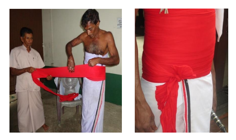
Fig 4 tightening the cloth to the waist by making a knot

The extravagant dress form was formed by many knots. Twisting the edge of the cloth or pieces and wrapping around the waist creates a firm knot. Coomaraswamy (1913) states 'needless to remark, there is much art in wearing garments which are not fastened by any stitch or pin", it is suggested that the knot is a creative indigenous mechanism of joining fabrics together. Extended twisted knots were placed suspending both waist sides.