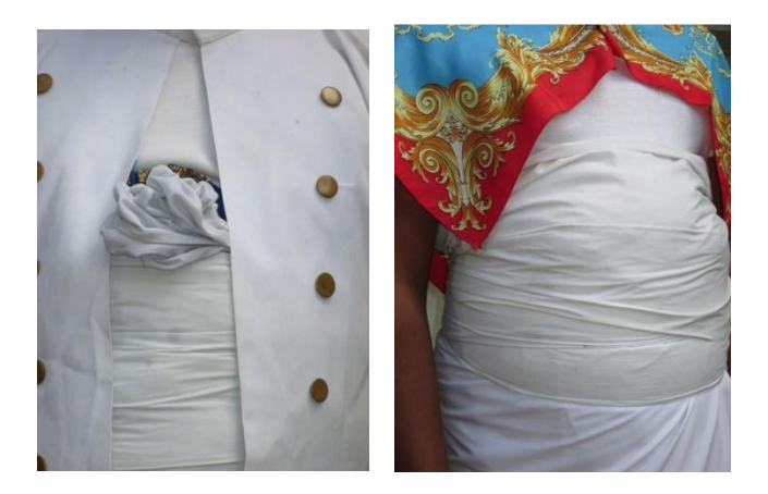
Fig 5 different knots of "Thuppottiya" dress