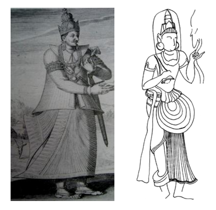
Fig 3 King Wimaladharmasooriya1Fig 4 King at Aludeniya temple, Gampola

a decorated waistband. The King draped the lower cloth according to the traditional practice of the era. Comparing with the previous eras it was seen that the lower dresses of the Kotte era were formed in a different manner. There was only a single fold arranged to one side of the waist (most probably the left side) which has a pointed edge. The fold on the left side of the waist developed in its size to a much greater extent during the last phase of the 16<sup>th</sup> Century evident in the dress of King Wimaladharmasooriya 1(1591-1604).