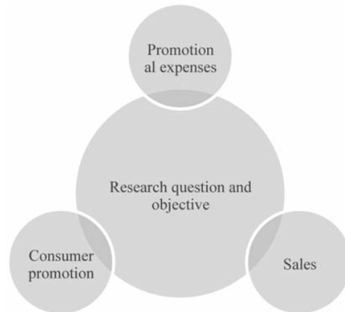
Figure 1: Research question & objective

between consumer promotion, promotional expenses and sales. Research question is raised as "whether promotional expenses have impact on sales". This research tries to set "to know the impact of promotional expenses on sales" as objective.