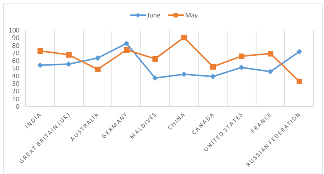
In May, the largest market source for tourists was India, followed by the United Kingdom and Australia. After the terrorist attack, Sri Lanka has lost some market opportunities for tourism at international level. Compare to 2018 may the Arrivals from India, Germany and China were declined respectively 90.7%, 74.4, % and 73.3% in 2019 May. It can be pointed out as a very big loss to Sri Lanka. Even though because of the government recovery procedure several countries responded positively to the tourism sector. But some countries still have a fear of safety and security in Sri Lanka's tourism sector.