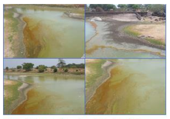
Figure 3. Sagamam Reserviour during Draught Season

Although, the local government authority called; Thirukkovil 'Pradeshiya Sabha' (PS) has initiated the bowser supply daily and weekly basis in order to