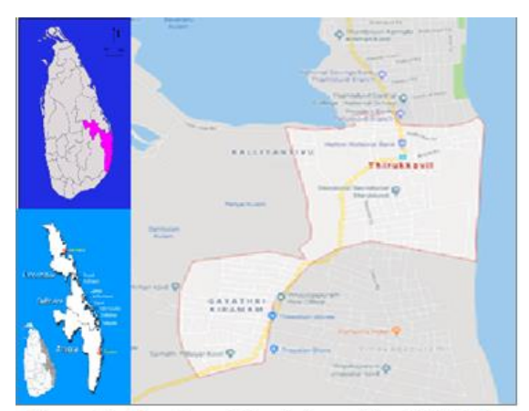
Figure 01: The Map of Study Area (ArcGIS 10.5)

In Sri Lanka, there are two major types of drinking water supply systems have been implemented by the government namely; Rural Water Supply (RWS) and Urban Water Supply (UWS) systems which provide safe drinking water service to the public, in collaboration with government, donor agencies and international organizations. The NWSDB is an authorized body which has established UWS system as sustainable and permanent solution to provide safe drinking water in Sri Lanka. According to the policy of UWS, the minimum number of household required not less than 2500 in an area where the NWSDB can establish UWS to extend the service. The Thirukkovil area is also having the capacity for implementing UWS scheme. Figure 01 shows the map of the study area.