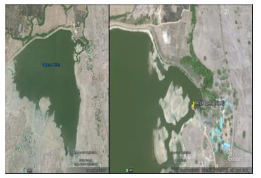
Figure 2. Sagamam Reservoir, Thirukkovil DSD, 2019

However, the aforesaid beneficiaries also receive limited water supply with time restriction due to the inadequate water sources. And it found that scarcity of water became as serious public concern, and it creates socio, economic, educational and livelihood problems among public. The demand for water connection has been increased in the study area, because they do not have alternative way to get fresh drinkable water. The UWS scheme is not in a position to provide drinking water for their requirements as it is already scuffle to provide uninterrupted water supply due to the current dearth of water sources in the area. The major root cause of Sagamam reservoir has lower quantity of raw water, especially during draught season in the recent past due to many factors that need to be addressed. The following figure 2 shows the map of reservoir.