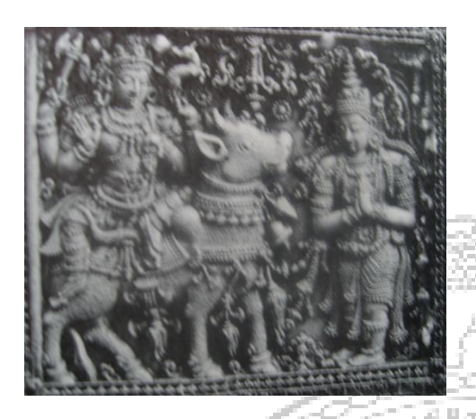
Figure 3. The King is participating in a ritual.

Casket inv.no.1241 ivory- right end of the gable, Munich Treasury in Germany.