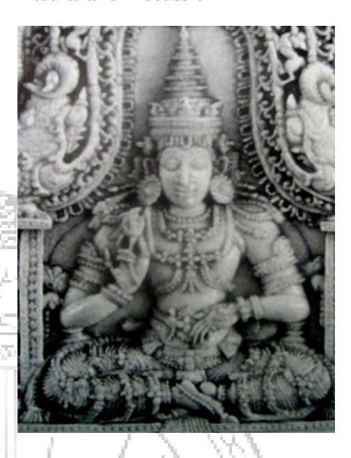
Figure 1. The King Buwanekabahu V11 of Kotte at the royal platform.

Casket inv.no.1241 ivory- right end of the gable, Munich Treasury in Germany.