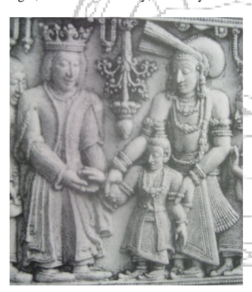
Figure 4. Prince Dharmapala at the coronation ceremony.

Ivory Casket inv.no1241, rear view bottom right, At Munich treasury, Germany