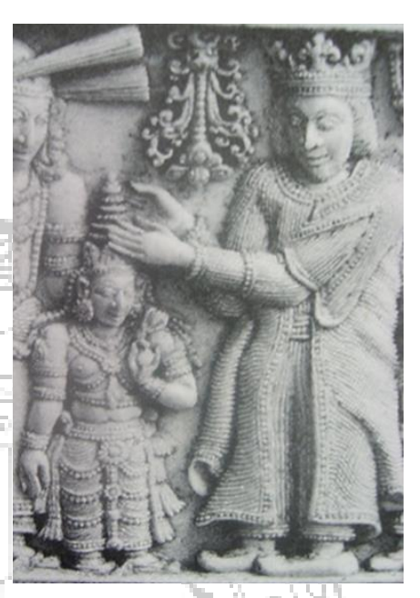
Figure5. Prince Dharmapala was crowned as a Portuguese King. Ivory Casket inv.no1241, rear view bottom right, At Munich treasury, Germany