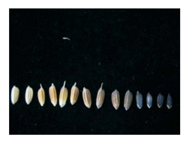
c. Variation in hull color