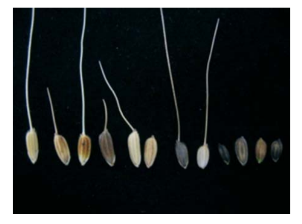
b. Variation in seed shapes

Weedy rice seed collected from Matara and Ampara districts showed great variation for the own length which varied from 0 (ownless) to 10 cm (Fig.1a). A considerable diversity was observed in seed shape (Fig.1b) andhull color which varied from pale white to black (Fig.1c). Pericarp color varied from white to brownish red (Fig.1d). This variability observed among populations as well as within the populations.