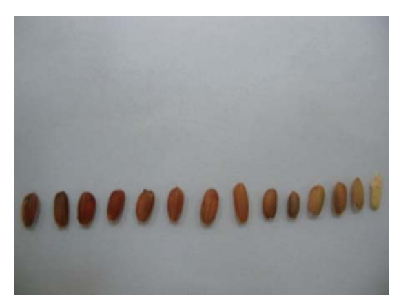
d. Variation in pericarp color