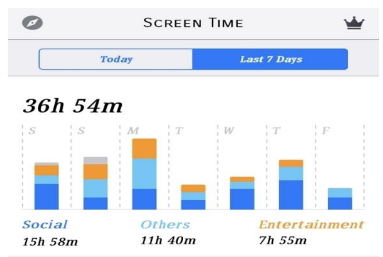
Figure 1: screenshot of one of the person's Screen Time software's last 7 days summary.

The study was conducted based on my village Pubbogama, I used quantitative and qualitative methods to collect the data. I included 75 young boys in my research to get the results. All boys are students. And also, I choose 15 - 18 age boys. There were 75 questionnaires were given to the students with 20 questions and I received 72 responses that can be used for this study. All the participations were asked to complete the questioner to measuring laptop use, watching TV, use of Internet like that. Mainly I used the software "Screen Time" to get the hours they use mobile phones. And also, I did informal discussion too with the participant to get data. After that outcome were enlightened using charts. According to my research mobile phone is very first enemy to the youngsters' life.