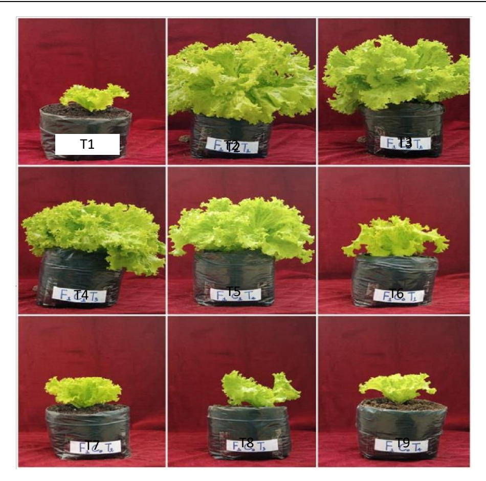
Figure 2. Overall Performance of Lettuce in Different Treatments.

T2, T3, T4 and T5 shown the better growth and yield performance. Among those, T2 shows the better results.