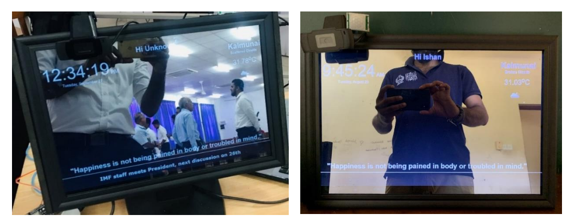
Figure 14. Output

is given in Table 1. This clearly shows that the total cost of the proposed smart mirror is substantially less than the market price at that time.