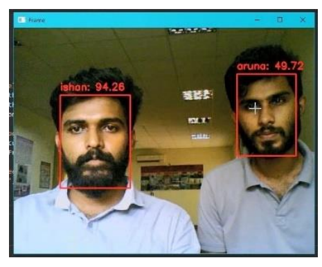
Figure 10. Face Recognition