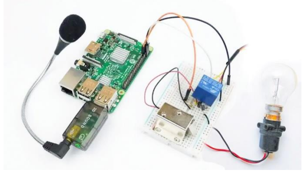
Figure 12. Voice Controlled Room Automation

Otherwise, the mirror will not work until the right command is received from the user. We also expect to control most of the things using Ai Bot (Google Assistant) and the room automation system will work using voice commands that are recognized by Ai in the same way. The proposed system design for voice controlled room automation is shown in Figure 5.