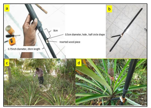
Figure 02: a) Parts of developed tool; b) Final view of developed tool; c) Field evaluation of developed tool; d) applying fertilizer at the leaf base of pineapple plants

The rubber band is tightly fastened to the fixed piece, while the screw is connected to the movable piece. When the movable piece is pressed downward, it moves easily, but it returns to its original position with the aid of the rubber band. The open ends of both pieces meet together when the movable piece is pushed down. This action triggers the release of fertilizer, a process that occurs within seconds. The released fertilizer flows through the outlet end of the instrument, targeting the base of the pineapple crop. To utilize this tool effectively, fertilizer must be loaded into the fixed piece, which has a narrower PVC structure, creating the necessary pressure for the fertilizer to descend. By pushing the fertilizer container, minor pressure is applied to the long PVC pipes, facilitating the controlled release of the fertilizer.