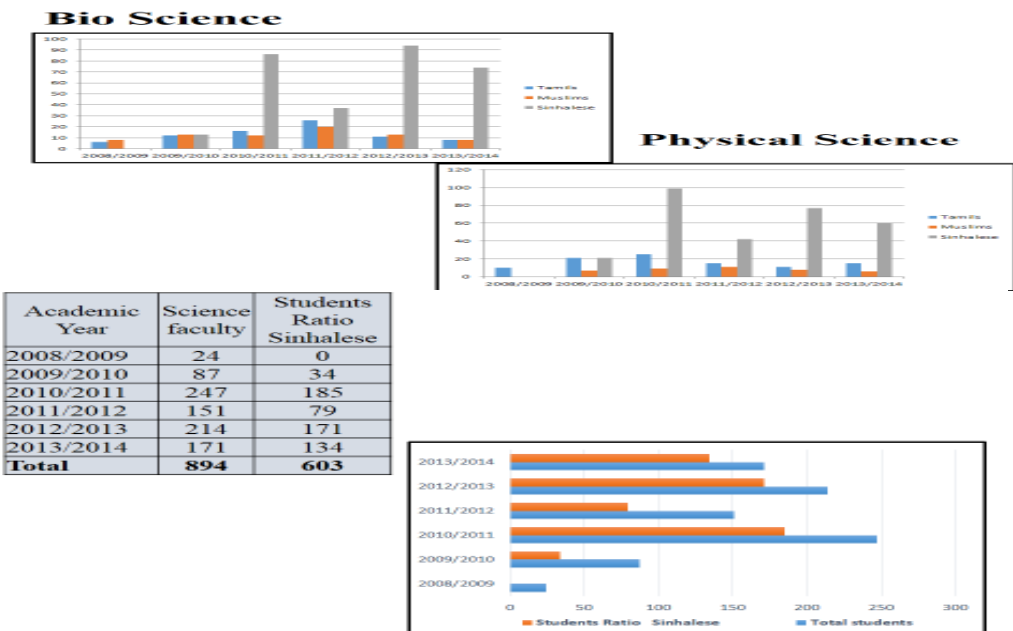
Table: 03 Students Ratio in the Faculty of science at the EUSL

The following Table shows that the student's ratio of the Faculty of science during the last five year that has increased