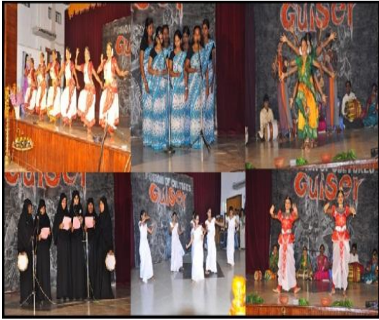
Figure 3: Cultural programme for Social harmony undertaken by the multi ethnic students