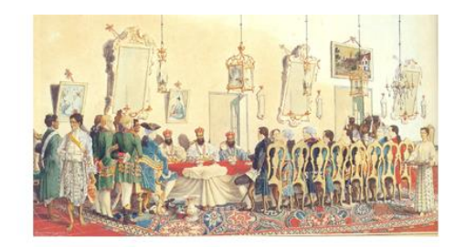
Figure 6 - Annual embassy of the king of Kandy, at Colombo in 1772. (Silva R.K de, Beumer W.G.M, Illustrations and views of Duth Ceylon, Serendip Publications, 48 Up Lands ways, London)

Therefore, ceremonial events were the most elegant and richest events where both foreigners and locals met each other in their exquisite outfits. The above description is well justified by vivid colorful painting of the conference between the Dutch governor and the Kandyan ambassadors in 1772. Therefore with the foreigners' wealthy, skillful, powerful background, it can be suggested that locals might have felt inferior to them. As a result of that the royalties might have predicted that foreign clothes were the most suitable dresses for displaying good social status. Foreign costume is automatically coupled with its superior status.