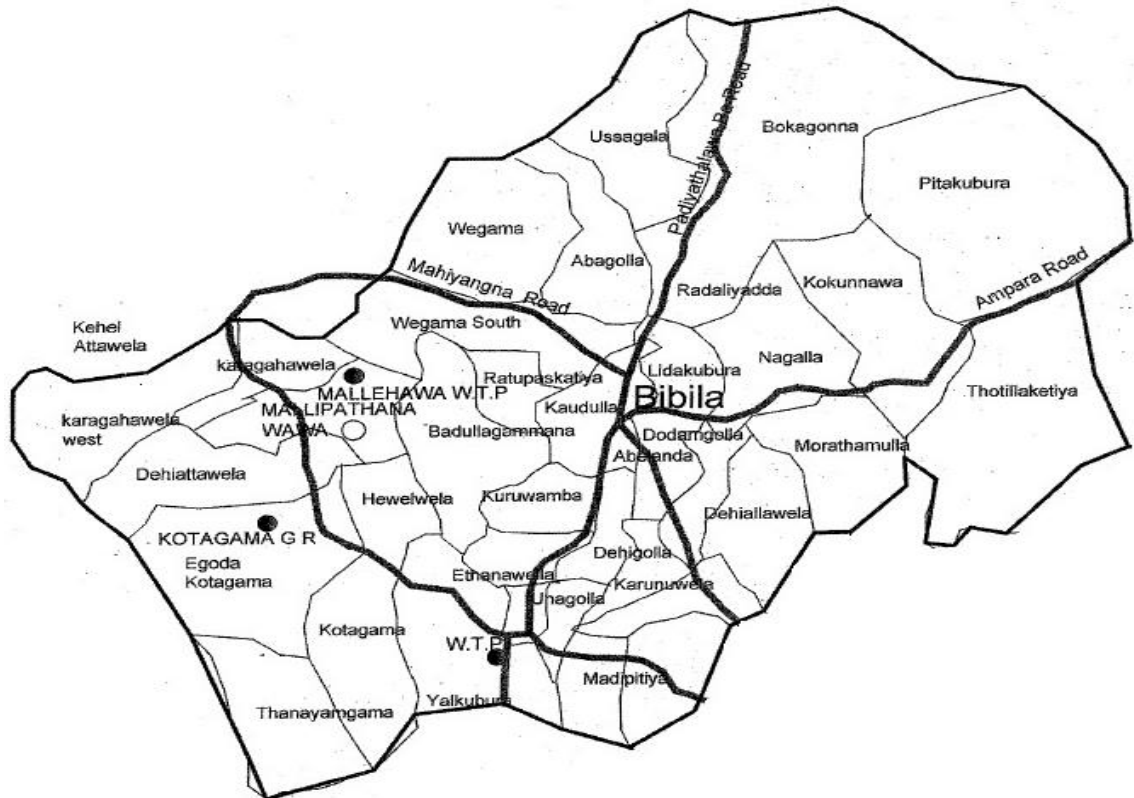
Figure 1: Coverage Area of Water Supply Scheme

Based on the consideration of the elevation, cost economic and suitability of distribution with lesser operation and maintenance cost the suitable coverage area of proposed water supply scheme was selected as shown in the figure 2