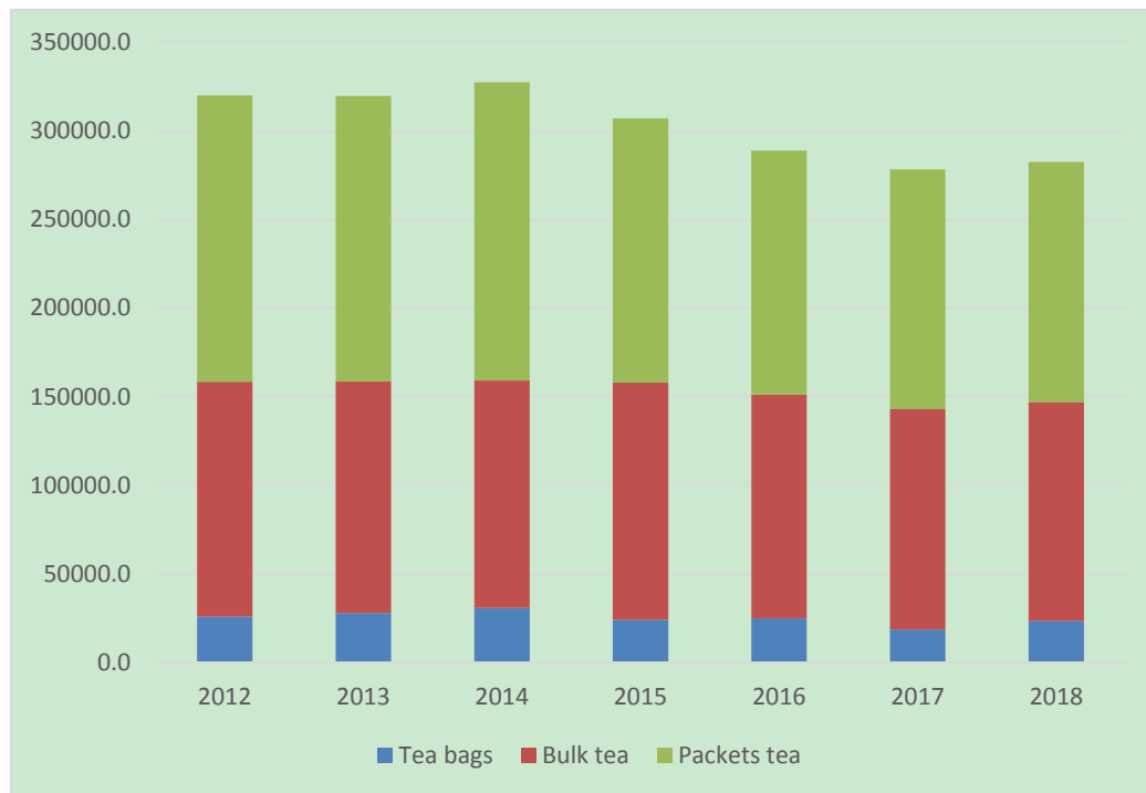
Figure 2. Exports of different categories of tea (Kgs.)

Figure 2 explains the exports of tea of different categories. Consumption of tea of value-added tea is increasing in the global market. However, Sri Lanka's exports of value-added tea is stagnant or declining. Interview with exporters revealed that consumer preferences have been changing in the international tea markets. In the world now consumers want tea bags and instant tea. The traditional tea brew is likely to be obsolete. The young generations prefer to tea products which is convenient to fulfill the requirements of tea. Some consumers want and some are expecting benefits of health from tea. The reason for Sri Lanka's catastrophe in some major markets is that it is unable to respond to the changing consumer preferences and demand. Consumers in the developed world are more sophisticated in their product choice and taste. Hence, products have to be developed to match the sophistication of the markets. Sri Lankan value added tea products exports are almost stagnant for the last several years. The reason for the stagnation in exports of value added tea products is the current focus on orthodox type of tea production. With the increasing consumption of teabag in the global market, Sri Lanka attempted to expand the CTC variety of tea production, but it did not succeed. Since Sri Lanka is unable to meet the requirements of global consumers, its global export share has been coming down in the international tea market.