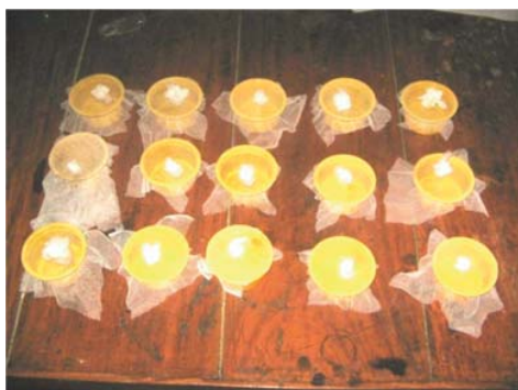
Fig.2: Photograph showing the larval rearing.

Fifteen plastic cups were filled with 70ml of filtered tap water. Then field collected healthy fifteen second/third instar of Lutzia larvae were placed in each cups individually and was starved for twenty four hours. Then each ten of same instar of genus Culex and Aedes larva and same size of Chironomous larva were provided as a prey for Lutzia larva. The cups were covered by mosquito net to prevent from other contamination of oviposition of flying organism. The total number of prey was thirty in each cup. Consumed prey larvae were counted every twenty four hours until all the predatory larvae were pupated and the surviving larvae of each three species were counted at morning time and eaten larva was replaced in each time to maintain the prey density as same. In this experiment twenty replicates were made.