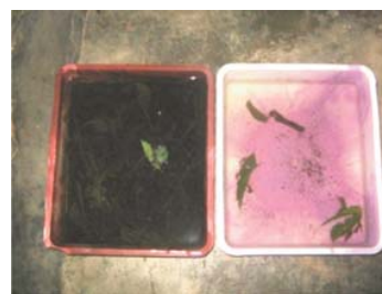
Fig.1: Photograph showing the two types of ovitraps

Plastic trays (29cm×24cm×6cm) with the capacity of 2500ml were used as artificial ovitraps. Two types of ovitraps were prepared. One was filled with straw soaked water and another one was filled with normal tap water. In these two ovitraps, water was poured more than \frac{3}{4} volume of the tray and the water level was checked and maintained approximately in same level.