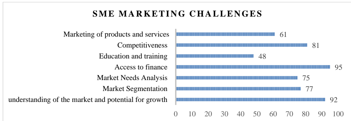
Fig 6: Marketing Challenges

Figure indicates that the respondents experienced the following marketing challenges: